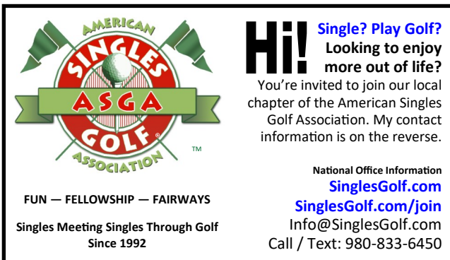
Front side of business card

25 Business Cards Will Be Mailed to You Upon Request!