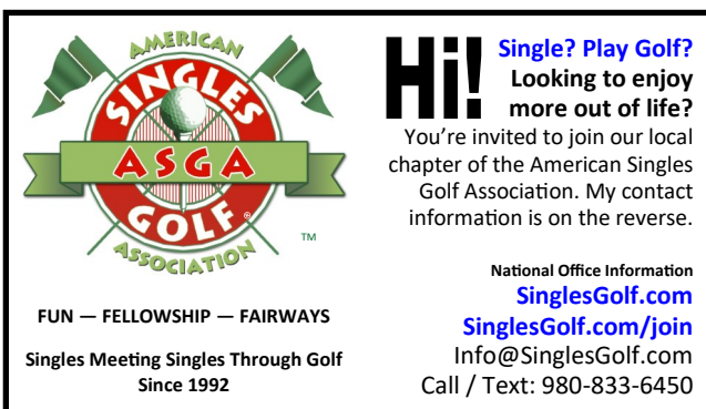
Front side of business card

25 Business Cards Will Be Mailed to You Upon Request!