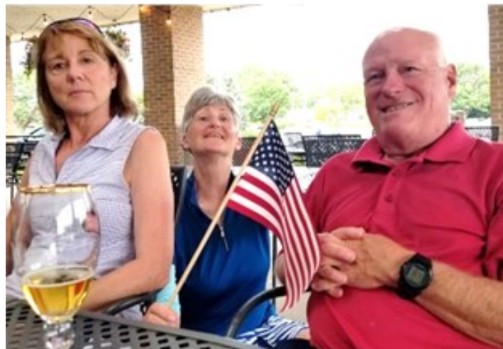
Water's Edge Outing