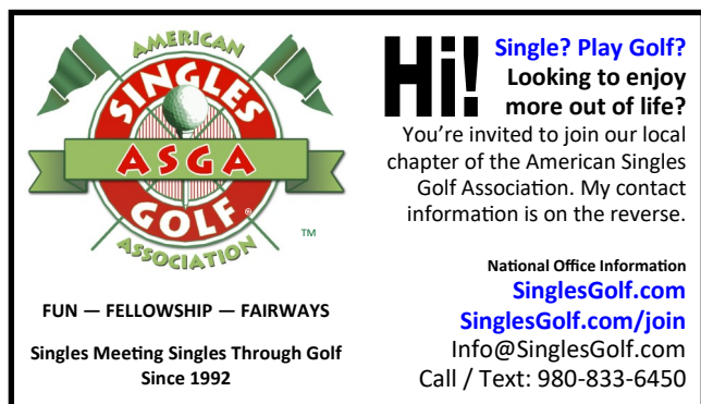
Front side of business card

25 Business Cards Will Be Mailed to You Upon Request!