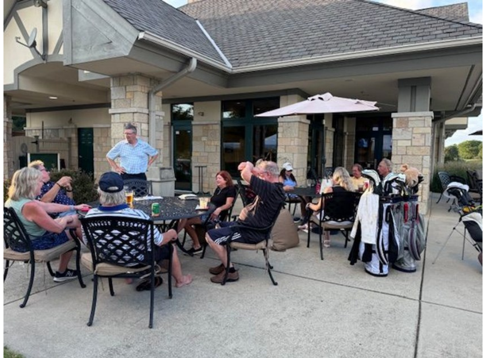
On the Stonewall Orchard patio, enjoying each other's company before award announcements.