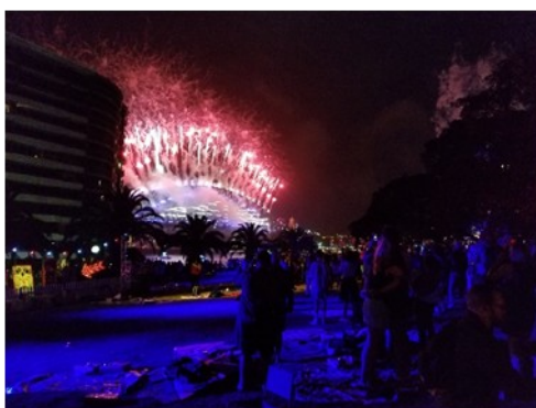
Sydney Harbor Bridge - New Year's Eve

G'day mates! Happy New Year from the land down under! I hope everyone had a wonderful holiday season. After a delayed start in Chicago and almost a missed connection in LA, I arrived in Sydney on the morning of December 31. Unfortunately, my bags went to Auckland, New Zealand. Thankfully I received them yesterday so all is good. Sorry, but the weather here is perfect and I will try to play some golf this weekend!!!