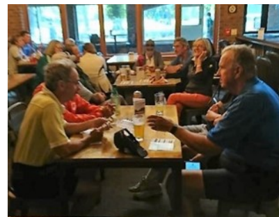
Winnetka clubhouse - apres golf