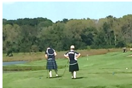
New ASGA uniforms?