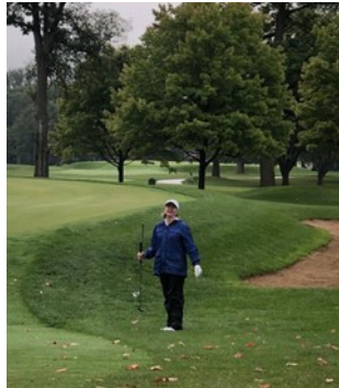
Only the finest wet-weather fashions