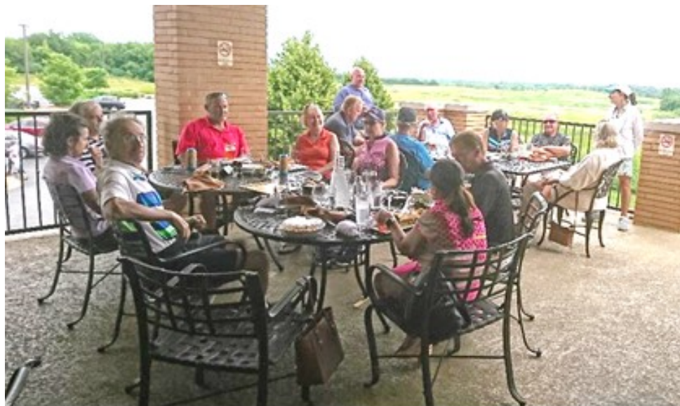
Apres golf at the Highlands of Elgin