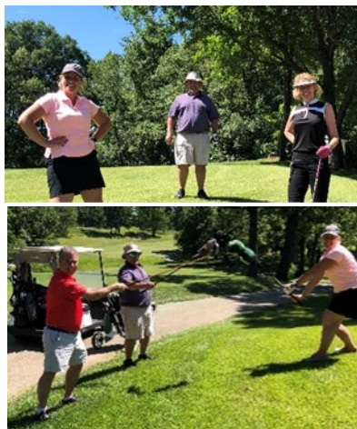
Twenty golfers enjoyed Village Links on June 21. Spots filled up quickly. Unfortunately, more tee times couldn't be added.