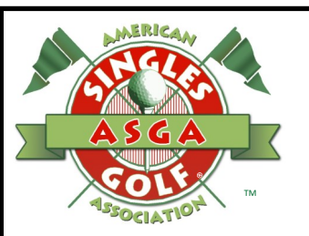
FUN — FELLOWSHIP — FAIRWAYS Singles Meeting Singles Through Golf Since 1992

25 Business Cards Will Be Mailed to You Upon Request!